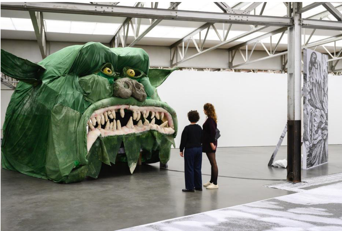
Monster Chetwynd, Hell mouth 3 , 2019

The works produced by the artists will be designed for very young children , presented at their height, with a play on scale and scenography , works that can be touched and handled, spaces that can be taken over to express yourself in a free and fun way, as well as for adolescents with a 'clubbing' area proposed by one artist, and one part of the exhibition providing older children with an opportunity to feature in the works of art and share their experience of the exhibition on social networks.