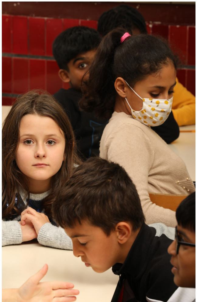
Year 6 primary class, Henri Barbusse School