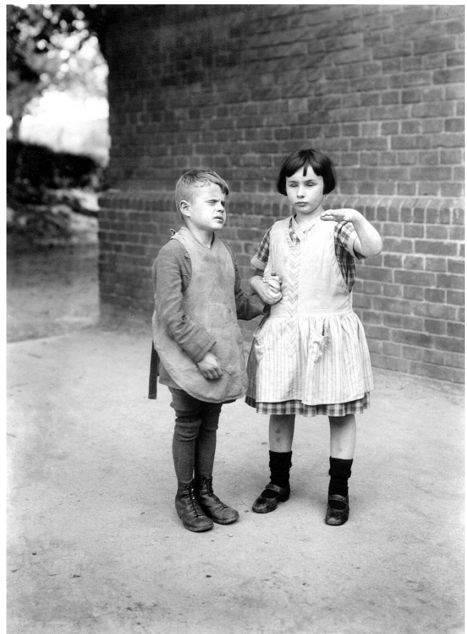
August Sander, Enfants aveugles-nés , vers 1930