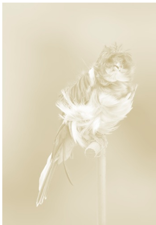
Carsten Höller, Canary, 2009 FNAC 2011-0165 (1à9)